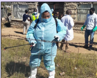
MEC Dube-Ncube during the fumigation of Thembalihle informal settlement

MEC for Economic Development, Tourism and Environmental Affairs (EDTEA) Ms Nomsa Dube-Ncube, Uthukela District Municipality and Alfred Duma municipality embarked on a mass fumigation of informal settlements programme in Ward 10 in Thembalihle outside Ladymith.