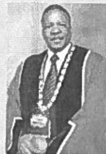
The Hon Mayor Cllr Inkosi NB Shabalala