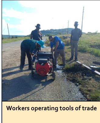
Workers operating tools of trade

The work continued as expected and it was then envisaged that soon the situation will return to normal and the community of Ezakheni and the surrounding areas will receive normal water supply.