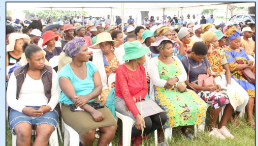
Community members who attended the roadshows

This was the first round of the IDP consultation processes. With this initiative uThukela District is trying to improve communication lines between municipality and the community so that both parties clearly understand what is going on in terms of budget allocation according to the community needs. The Mayor also introduced a contractor who will be undertaking the construction of precast VIP toilets at aforementioned areas – Wards 4,5,8,9 and 10 in Okhahlamba Local Municipality.