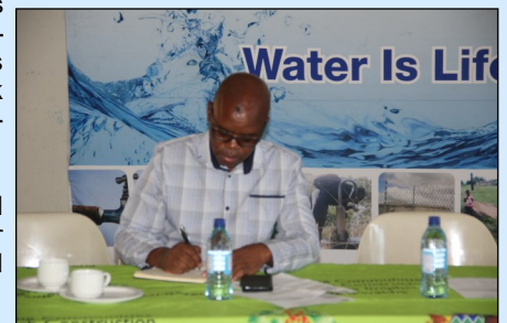
Official is taking notes during proceedings