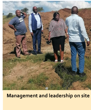
Management and leadership on site